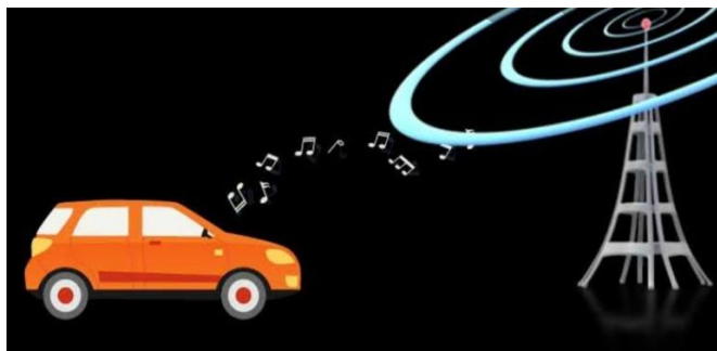
Fig. 2 Car receiving signal from transmitter

(GHG) discharges. In 2009, the transportation area radiated 25% of the GHGs created by energy related areas. EVs, with enough entrance in the transportation area, are relied upon to decrease that figure, yet this isn't the lone explanation resurrecting this extremely old and when dead idea, this time as a monetarily practical and accessible item. As a vehicle, an EV hushes up, simple to work, and doesn't have the fuel costs related with traditional vehicles. As a metropolitan vehicle mode, it is exceptionally valuable. It doesn't utilize any put away energy or cause any emanation while standing by, is fit for continuous beginning quit driving, gives the all out force from the startup, and doesn't expect excursions to the corner store. It doesn't contribute either to any of the brown haze making the city air profoundly contaminated. The moment force makes it exceptionally ideal for engine sports. The quietness and low infrared mark makes it helpful in military use too. The force area is going through a changing stage where inexhaustible sources are acquiring energy. The cutting edge power lattice, called 'brilliant matrix' is additionally being created. EVs are being viewed as a significant supporter of this new force framework contained inexhaustible producing offices and progressed network frameworks. Every one of these have prompted a recharged interest and improvement in this method of transport.