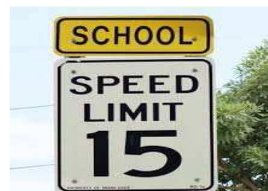
Fig. 1 Speed limit sign board near school

microprocessors are also still common, basically in more complex systems. The basic characteristic, however, is being dedicated to handle a particular task. Now adays people drive very fast, accidents occur frequently and there is loss of property and life. In order to stop such kind of accidents, to alert the vehicle's driver and to control their vehicle speed. RF innovation is being utilized the primary goal is to plan a Smart Display regulator implied for vehicle's speed control and checking of zones, which can run on an installed framework. Smart Display & Control (SDC) can be custom designed to fit into a vehicle's indicator panel, and displays information on the vehicle. The proposed work is comprises of two separate modules: zone status transmitter unit and receiver (speed display and control) unit. When the data is gotten from the zones, the vehicle's implanted unit consequently cautions the driver, to diminish the speed as indicated by zones, it hangs tight for few moments, and in any case vehicle's SDC unit naturally decreases the speed. This proposed work mainly illustrates the application of speed monitoring and control in automobiles through the implementation of an embedded based prototypical robotic model.