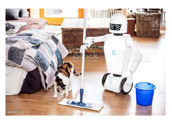
Fig. 4 Cleaning Robots [12]

Instead of placing our waste in the trash can, we humans scatter it all over the area. Therefore, there is more rubbish in the usual spots. which makes the cleaner or sweeper's work difficult. Cleaners cannot clean all trash for more hours, so instead of humans working there, if we introduce robots there, the task of cleaning will be completed easily. Nowadays, technologies are increasing rapidly, which makes humans' work easier and within a short span of time. The robots' cleaning will be easier and they will complete the work within a short span of time. As a result, humans developed cleaning robots. Fig.4 depicts the image of the cleaning robot.