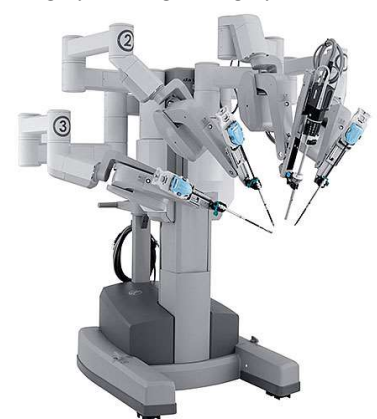
Fig.2 Surgical Robots [5]

Heart Surgery, General Surgery, Gynecologic Surgery, Thoracic Surgery, Urologic Surgery.