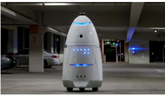
Fig.5 Surveillance Robots [18]

These kinds of problems require a modern solution and that's where the emergence of robots seems quite significant. Autonomous security robots are capable of patrolling complex environments and detecting anomalies in the environment through sensors and cameras. For the agricultural sector, mobile surveillance robots are the cost efficient and powerful solution instead of installing a temporary surveillance station These robots can navigate through complicated environment using satellite navigation and obstacle detecting algorithms. Fig.5 depicts the image of the surveillance robot.