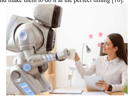
Fig. 3 Social Robots [11]

all the necessary details to the customers like the salesman does like saying about the product's features, specifications, price, availability, etc.., 5)Elderly Care which means that it will take care of the patients in the hospitals or the elders to say the timings of snack, sleep and make them to do it at the perfect timing [10].