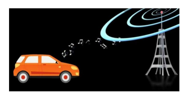
Fig. 2 Car receiving signal from transmitter

(GHG) discharges. In 2009, the transportation area radiated 25% of the GHGs created by energy related areas. EVs, with enough entrance in the transportation area, are relied upon to decrease that figure, yet this isn't the lone explanation resurrecting this extremely old and when dead idea, this time as a monetarily practical and accessible item. As a vehicle, an EV hushes up, simple to work, and doesn't have the fuel costs related with traditional vehicles. As a metropolitan vehicle mode, it is exceptionally valuable. It doesn't utilize any put away energy or cause any emanation while standing by, is fit for continuous beginning quit driving, gives the all out force from the startup, and doesn't expect excursions to the corner store. It doesn't contribute either to any of the brown haze making the city air profoundly contaminated. The moment force makes it exceptionally ideal for engine sports. The quietness and low infrared mark makes it helpful in military use too. The force area is going through a changing stage where inexhaustible sources are acquiring energy. The cutting edge power lattice, called 'brilliant matrix' is additionally being created. EVs are being viewed as a significant supporter of this new force framework contained inexhaustible producing offices and progressed network frameworks. Every one of these have prompted a recharged interest and improvement in this method of transport.