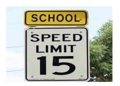
Fig. 1 Speed limit sign board near school

microprocessors are also still common, basically in more complex systems. The basic characteristic, however, is being dedicated to handle a particular task. Now adays people drive very fast, accidents occur frequently and there is loss of property and life. In order to stop such kind of accidents, to alert the vehicle's driver and to control their vehicle speed.RF innovation is being utilized the primary goal is to plan a Smart Display regulator implied for vehicle's speed control and checking of zones, which can run on an installed framework. Smart Display & Control (SDC) can be custom designed to fit into a vehicle's indicator panel, and displays information on the vehicle. The proposed work is comprises of two separate modules: zone status transmitter unit and receiver (speed display and control) unit. When the data is gotten from the zones, the vehicle's implanted unit consequently cautions the driver, to diminish the speed as indicated by zones, it hangs tight for few moments, and in any case vehicle's SDC unit naturally decreases the speed. This proposed work mainly illustrates the application of speed monitoring and control in automobiles through the implementation of an embedded based prototypical robotic model.