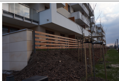
il. 1: Garden on the embankment

Location: Mokotów, street: Bluszczańska Architect: Europrojekt Architects Implementation: 2013-2016 Structure type: Complex of 3 buildings (1st stage, ultimately three stages) Function: Residential, service Above-ground / underground floors: 4/1 Residential premises: 396 Premises area: 31 to 93 m 2 Flood risk: 20-year water and high groundwater level