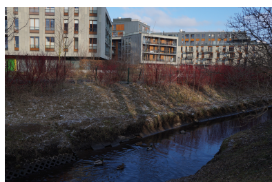
il. 3: Estate just above the canal

Location: Mokotów, street: Bernardyńska Architect: Britt Plan Investor: Marvipol Implementation: 2012-2014 Structure type: Complex of 3 buildings (2 stages) Function: Residential, service Above-ground / underground floors: 4-6 / 1 Residential premises: 416 Premises area: 36.9 to 156.2m 2 Flood risk: Buildings exposed to 20-year water