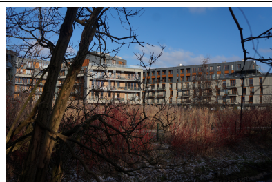
il. 2: Massive graphite blocks just above the canal