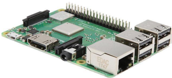
Fig.2. Raspberry pi

The Raspberry Pi is a series of small single board computers developed in the United Kingdom by the Raspberry Pi Foundation to promote the teaching of basic computer science in schools and developing countries. The original model became far more popular than anticipated, selling outside its target market for uses such as robotics.