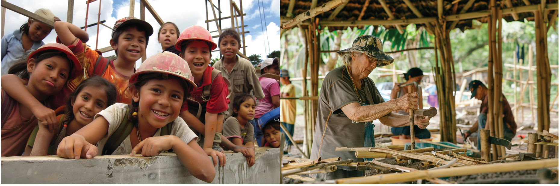
FIGURE 6. Generational integration into productive and educational systems must be constant throughout human life. Created by Midjourney.

A policy for local peace communities, where academia, productive industries, and labor forces are linked, becomes a robust multi-scale project. This approach advances towards a multinational peace effort (figure 5).. A movement for international peace based on that immediate connection from the social base, reconsidered as people in poor and abandoned societies as a source of integration to the immediate means of production based on self-manufacturing where they transform their immediate community resources into useful means for civil works immediately required. Transforming the operational skills of existing structures into modernized ones through the technologies of reuse and rematerialization of urban solid waste, of old constructions to be demolished or disassembled to appreciate their structural possibilities still present in the materials.