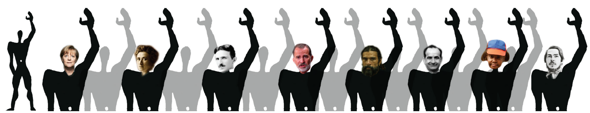
FIGURE 5. he fragility of social members in falling into homelessness is comparable to the human potential for overcoming challenges. Own creation.

A policy for local peace communities, where academia, productive industries, and labor forces are linked, becomes a robust multi-scale project. This approach advances towards a multinational peace effort (figure 5).. A movement for international peace based on that immediate connection from the social base, reconsidered as people in poor and abandoned societies as a source of integration to the immediate means of production based on self-manufacturing where they transform their immediate community resources into useful means for civil works immediately required. Transforming the operational skills of existing structures into modernized ones through the technologies of reuse and rematerialization of urban solid waste, of old constructions to be demolished or disassembled to appreciate their structural possibilities still present in the materials.