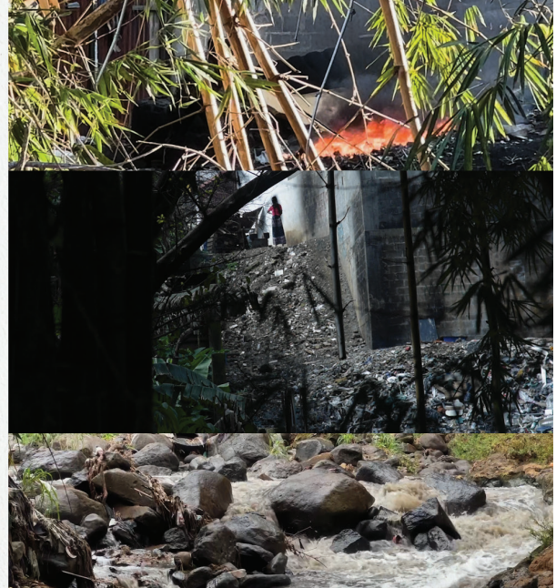
FIGURE 3. Urban pollution of natural environments. Here represented by the Torres River in San José, Costa Rica.