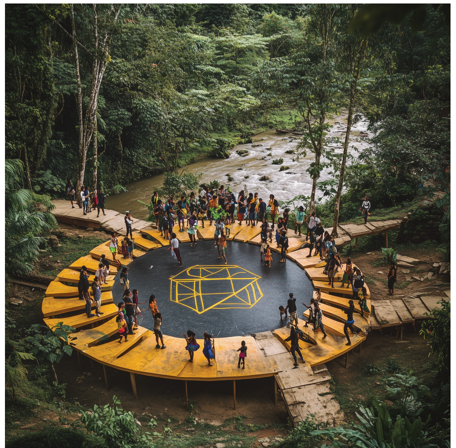
FIGURE 1. Social actions gathered for the self-fabrication of their political understanding. Created by Midjourney.

Design anthropology through technology and no linear politics