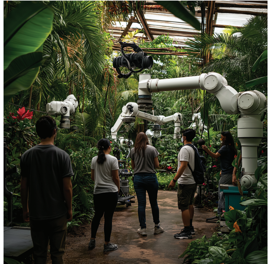
FIGURE 7. Communal self-fabrication without hierarchical educational walls. Created by Midjourney.

Ecology is a source of understanding and structuring in which humans are part of a greater whole called the biosphere (Vernadski, 1998), the maximum