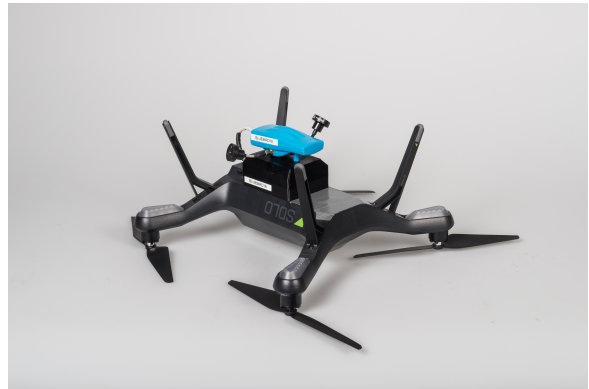
Fig. 1 A swarm payload added to a COTS drone

As reported earlier [3] the current platform used for the development is the 3DR Solo commercial-of-the-shelf (COTS) quadrotor. The Solo is uniquely suited for a swarm platform in that it allows third-party integrations while still featuring a reasonable cost (MSRP $1000). To enabling swarming, a communication payload talking to Pixhawk autopilot is added to each platform. While the