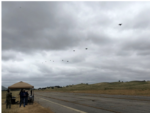
Fig. 2 Experiment setup at Camp Roberts, CA

All tests were conducted in a restricted airspace R-2504 in Central California. (Performing tests within a restricted airspace is an advantage as it allows us to test concepts that might otherwise not be possible or permitted.) A compact area of approximately 100m-by-100m was utilized (Fig. 2).