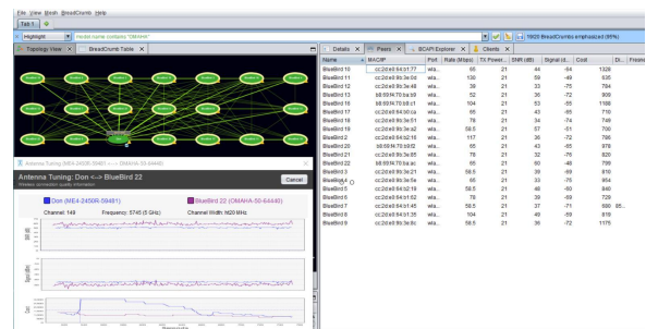
Fig. 4 A snapshot of mesh network health monitoring

of a flight test employing ten (out of twenty) UAVs with reactive collision avoidance, mesh radios and decentralized swarm control algorithms, while Fig. 4 shows an example of mesh networking status monitoring.