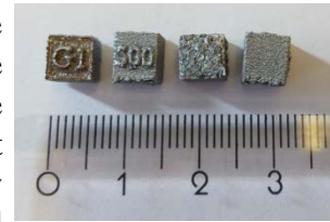
Fig. 1. Test cubes produced by L-PBF.

After the external drying the as-received powder showed a considerable mass loss of 0.05%, probably due to moisture reduction. The density measurements of the cubes built after different drying strategies do not show significant differences. The density values are approximately 96% (2.6 g/cm 3 ) for all AlSi10Mg cubes. There are hardly any differences visible between the externally and internally dried specimens, see Figure 2. The average pore size does not seem smaller after drying, which agrees