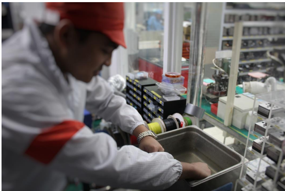
Figure 3. Work Immersion Student performing his task in the Test Engineering Department of Knowles Electronics (Philippines) Corporation

STEM students also perceived their work immersion experiences as an avenue to improve their work-related competencies, helps them make informed career choices, and creates employment opportunities straight out of Senior High.