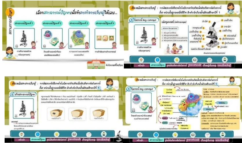
Figure 4. Example of learning environment

2.1 Design a learning environment for use in promoting students' analytical thinking skills. of 4 problem based Figure 4.