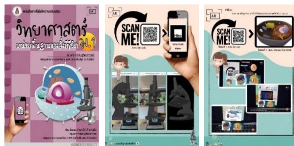
Figure 3. Example of AR book on the basic of life units.

1.3 AR book has developed consisting of 4 modules Once it has been revised as recommended by experts, it will be used by teachers to use with their target audience. Example, AR book “the basic of life units” in Figure 3.