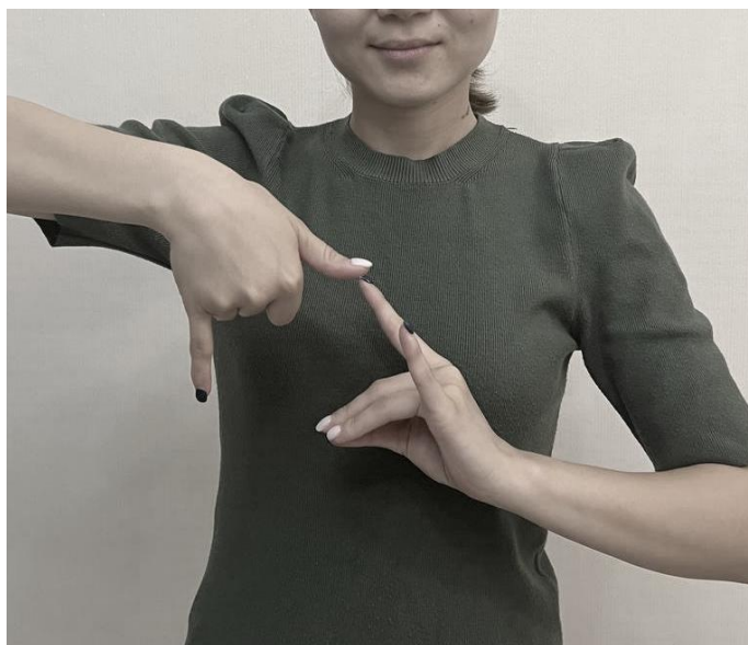
Figure 1: Designation “СӨМКЕ ОРЫНДЫҚТЫҢ ҮСТІНДЕ (bag on the chair)”

The main speech when performing the utterance (1) is missing, it is impossible to pronounce two words at the same time. Moreover, the statement (1) conveys all the necessary information about the spatial relationship of objects [1].