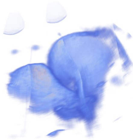
Figure 1: Pair of ultrasound volumes aligned using the dense voxel-based approach. The part in the middle is a shared region between the two, while the left part belongs to the first volume and the right part belongs to the second

The preliminary qualitative results performed in vitro show that from a set of consecutive ultrasound volumes we can construct an extended field-of-view using only ultrasound images without any tracking markers as shown in Figure 1 and Figure 2.