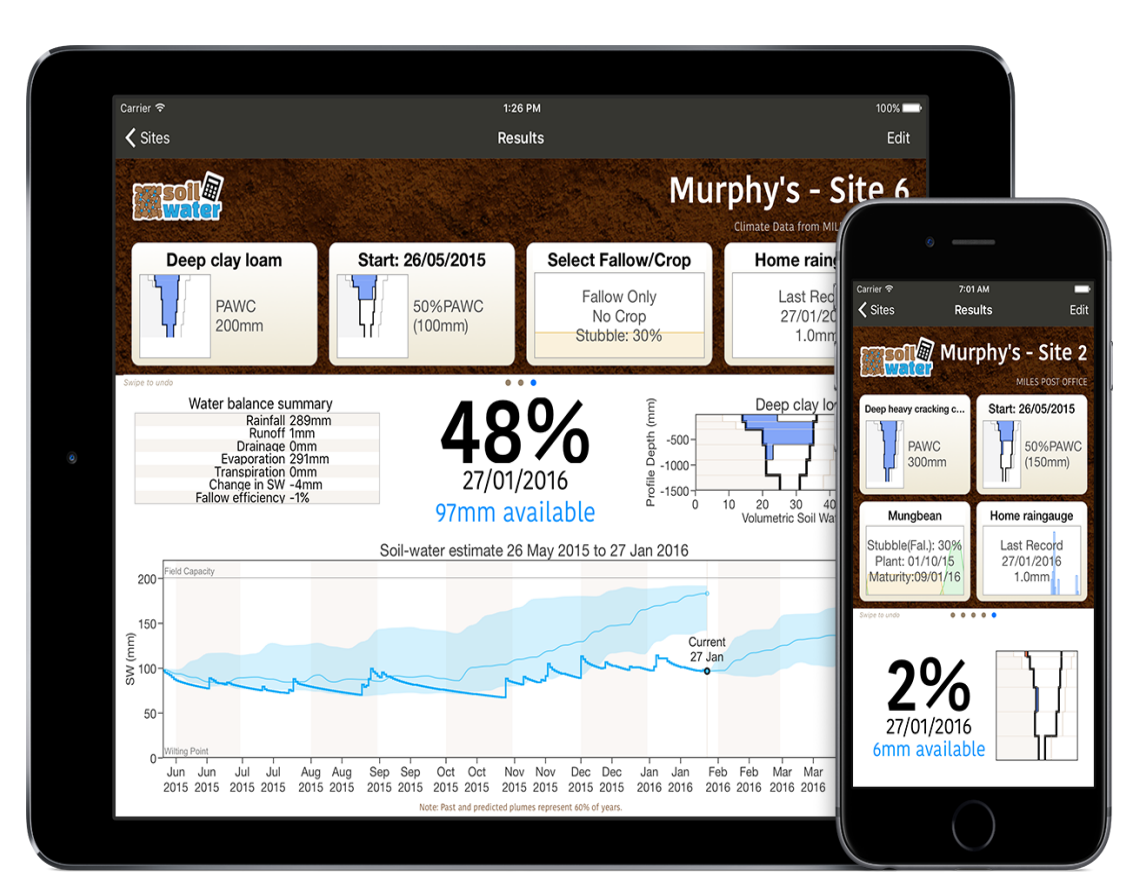
Figure 4 SoilWaterApp is an example of a soil moisture data consumer that prior to the DSI was required to develop and maintain links to multiple disparate data sources in order to provide a rich diversity of data for the applications users. With the DSI only one set of APIs' is required for most data discovery and access.