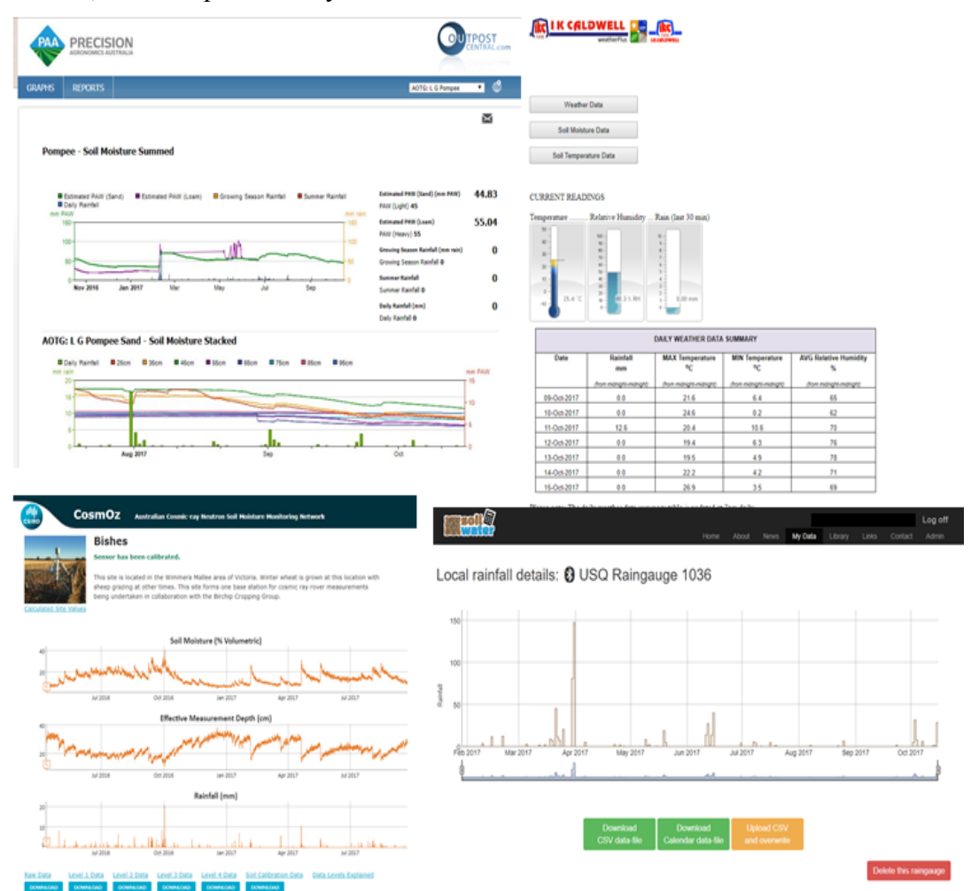
Figure 2 A selection of the various portals a single landholder may have to visit to view relevant data about their property.

information for the client to interact with the desired API directly, either native data services, or those provided by the O&M Translator.