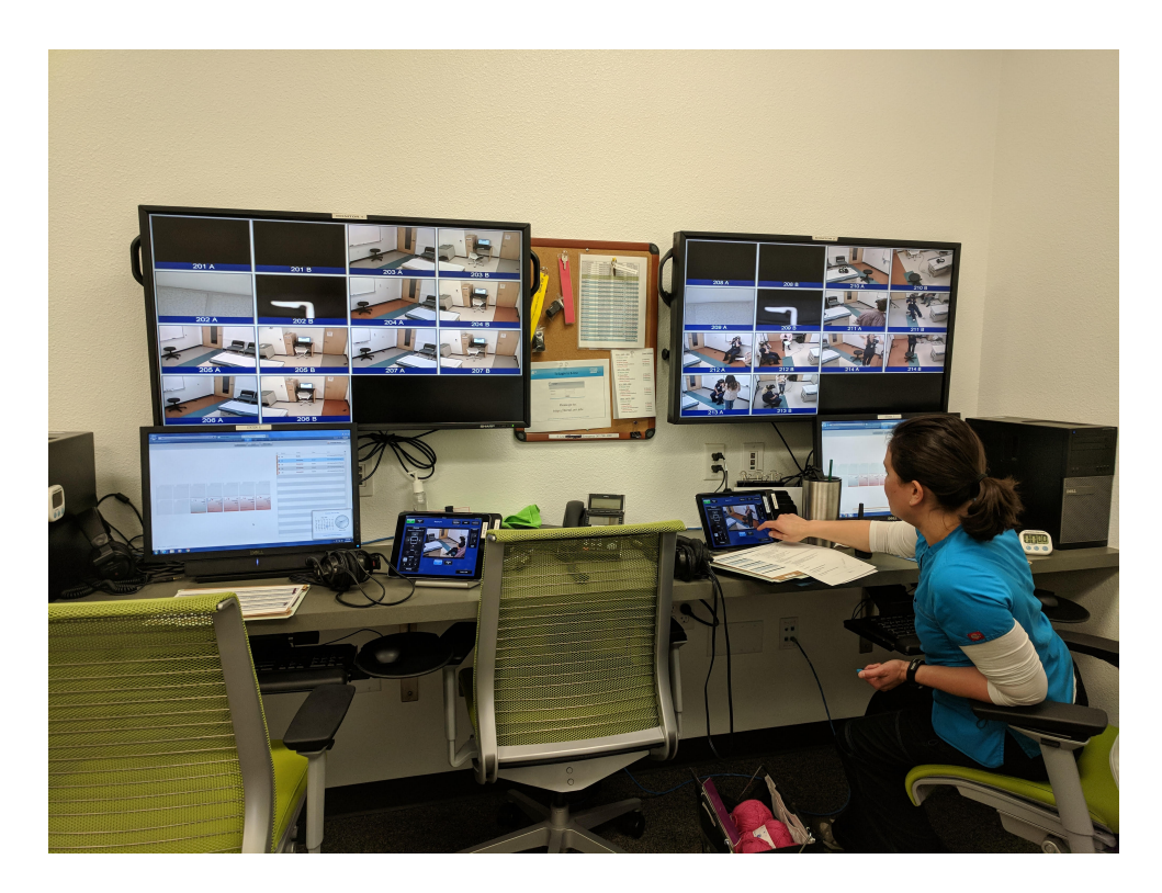
Figure 2: A picture of the standardized patient room control station.