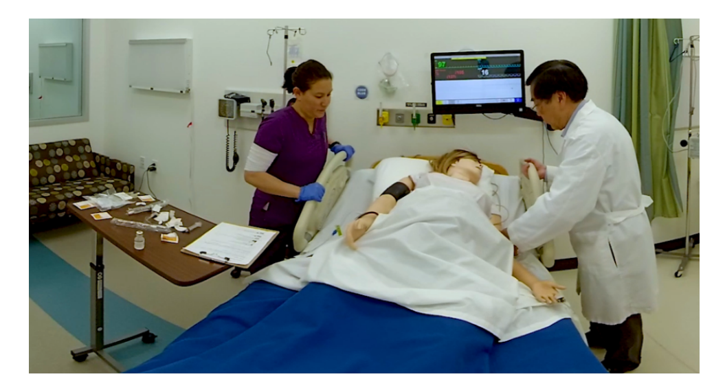
Figure 4: A screenshot of the 360° video playing for each participant

AOIs were identified by the authors, and then we created invisible boxes that would move if the correlating AOI in the video moved. This means that when the nurse moved, so did her corresponding AOI.